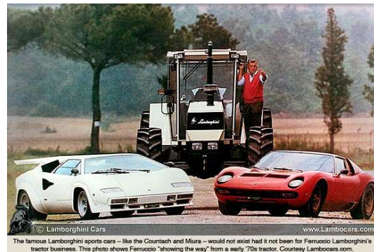
The famous Lamborghini sports cars – like the Countach and Miura – would not exist had it not been for Ferruccio Lamborghini's tractor business. This photo shows Ferruccio "showing the way" from a early '70s tractor.

Then Ferruccio got jealous of Enzo Ferrari because Enzo was making fast red, cars with horses on and attracting girls. So Ferruccio thought he would make even faster cars that where yellow and had Bulls on. And now Lamborghini is a successful super car company.